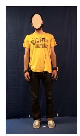
Fig. 2. Frame from a participant's body. The participant is wearing a micro for the voice and a wristwatch for physiological measures. A force plate is hidden under his feet.